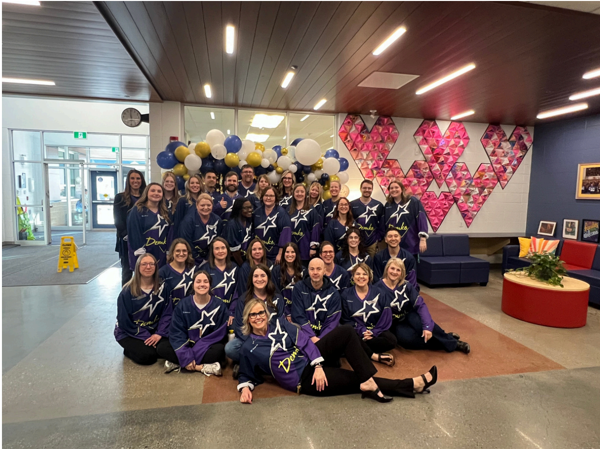
JMD Staff at 2025 Open House

As the days grow longer and the weather warms, we are excited to welcome the vibrant season of spring! This time of year brings new beginnings and fresh opportunities for growth and learning. With blooming flowers, outdoor activities, and a renewed sense of energy, we look forward to watching our students thrive as they continue to explore, create, and engage with the world around them. Together, let's embrace the season of renewal and encourage our children to enjoy the beauty and promise that spring has to offer.